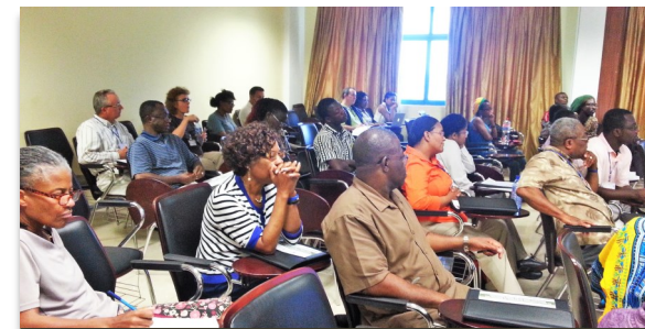
Participants at an International Conference held at UCC