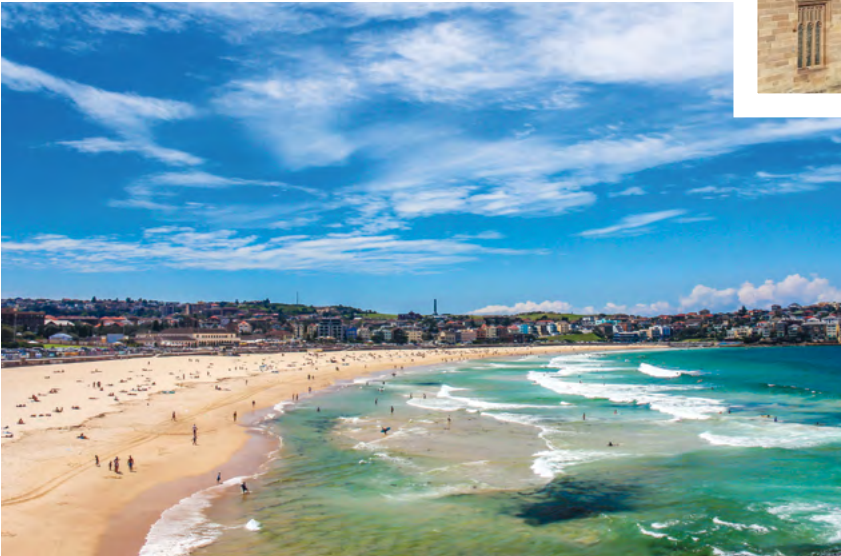
Below right: Queen Mary Building.

Additional materials, equipment and field trips may apply to some units of study. Amounts can range from $50-200 per unit of study.