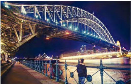
#iconicoz Instagram photo competition entry by Jessie, USA