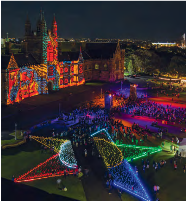
Vivid Lights at The University of Sydney