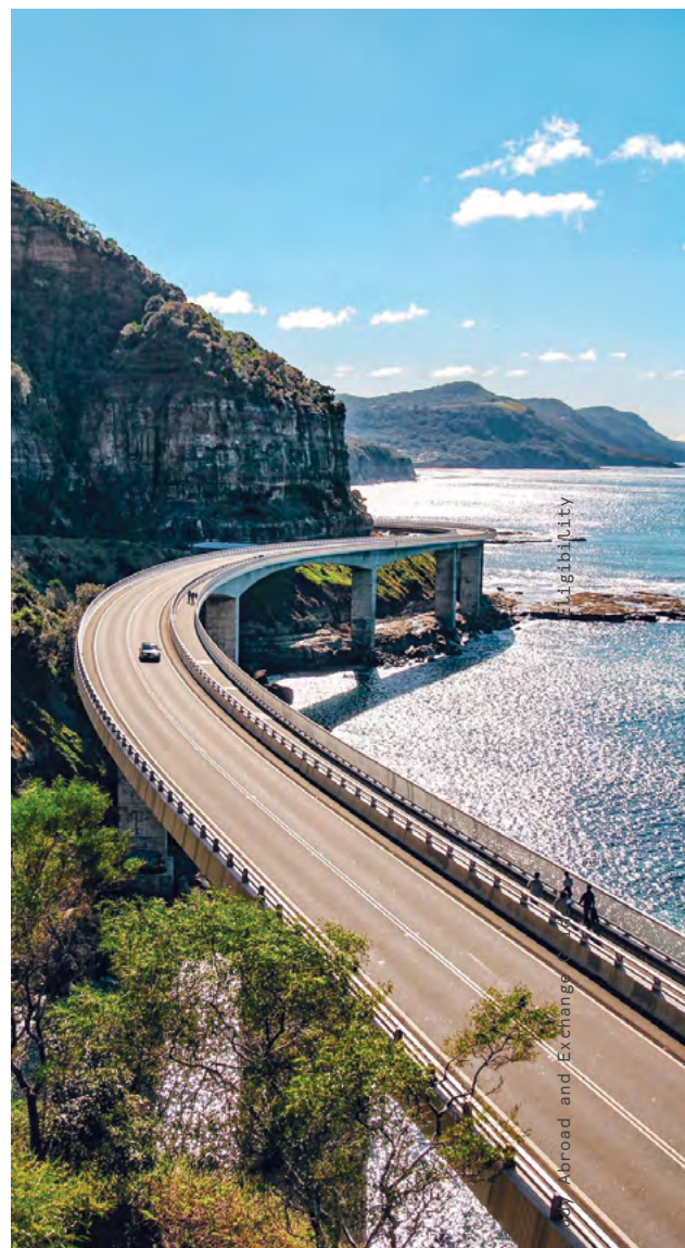
#downundertravels Instagram photo competition entry by Wyatt, USA