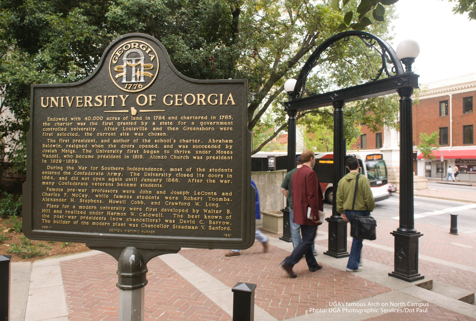
UGA's famous Arch on North Campus