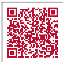
NSE in Canada